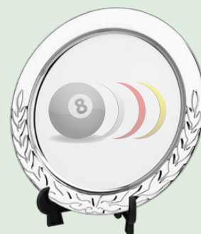
Actual trophy may vary from image

As usual, all teams are automatically entered into the CUP competition upon registration. Should they be unsuccessful in winning through to the last 16 of that competition, they are entered into the SHIELD . And now, new for Winter 2024-25, if they don't reach the last 16 of that competition they're entered into the PLATE! This means that all teams will be in one of the three competitions well into the New Year!